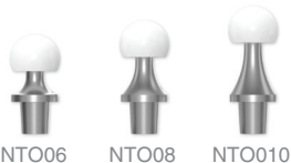
NTO06 NTO08 NTO10