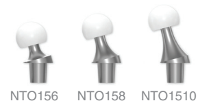
NTO156 NTO158 NTO1510