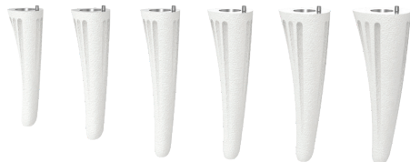
STOXS STO0 STO1 STO2 STO3 STO4