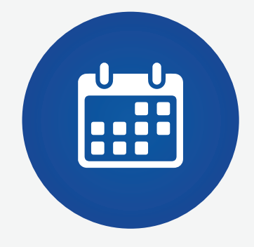
Date Friday, May 16