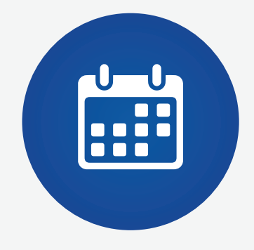
Date Friday, July 4